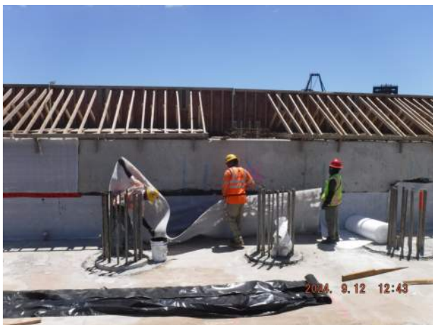
Pier 42: The carpentry crew (Kaimi's) installed the expansion board from STA 16+00 to approximately STA 13+00 of the WSCR