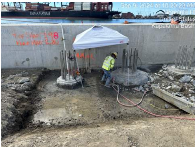
KIWC performing shaft top prep at approximately Sta. 10+50