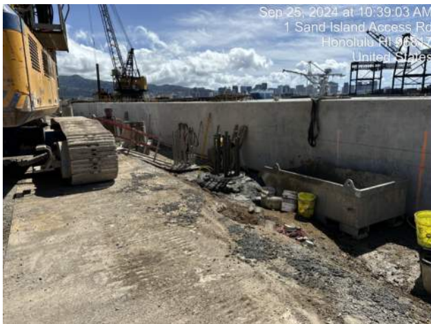
KIWC finished pouring CIDH shaft 24-A2-36