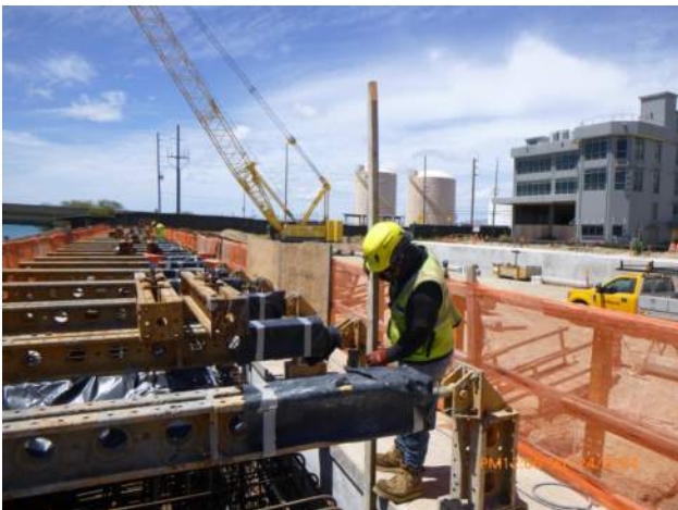
KIWC preparing for CWCB pour #23.