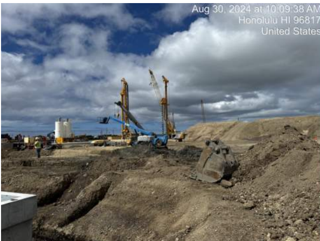
PF continued predrilling in the junction structure soil mixing area on Pier 42