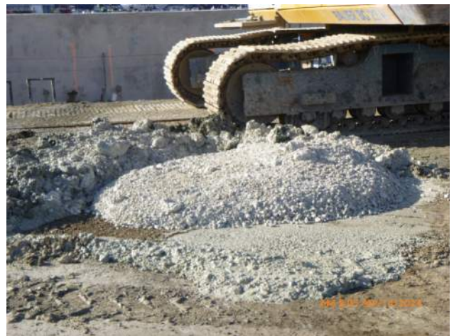
View of spoils from CIDH shaft 28-A2-36.