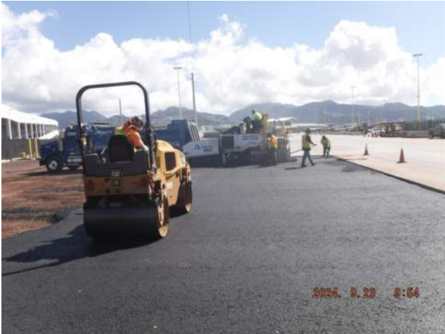
PCCP: Amazon block out - RB used the CAT CB 34B double drum roller to compact the asphalt pavement