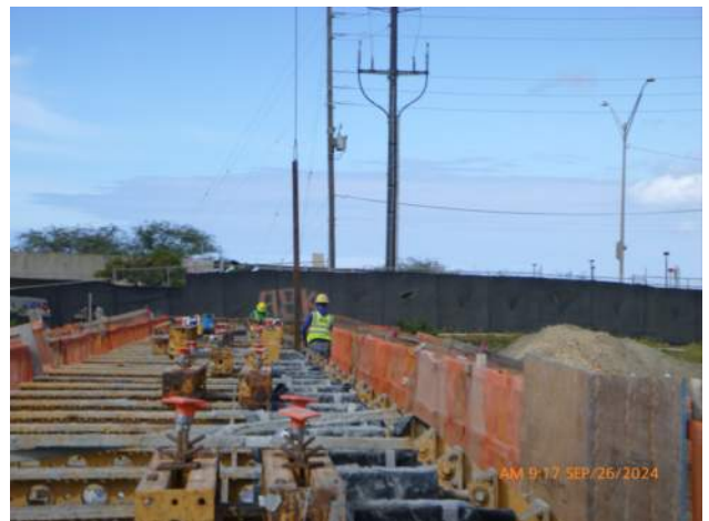
KIWC removing the bulkhead from the end of CWCB pour #23.