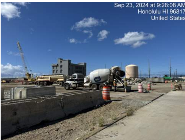
CIDH slump loss concrete on site