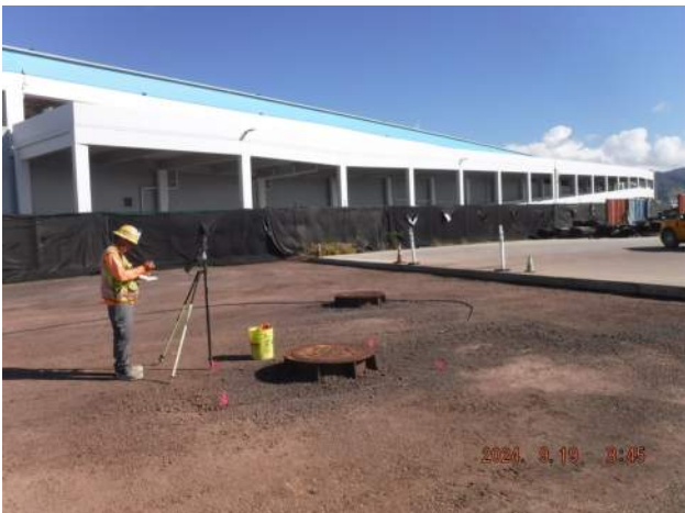
PCCP: Amazon Block out - KIWC surveyor verified the elevation of the manholes were out of plumb