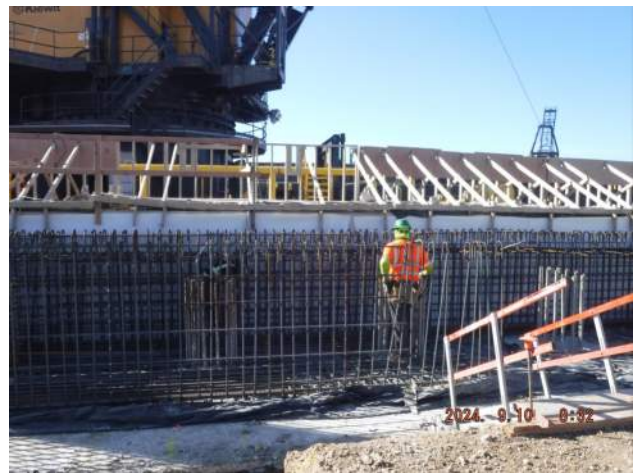
Pier 42: HRSPI crew continued installing the rebar cage for A1 of the WSCRb from approximate STA 17+00 to STA 19+00