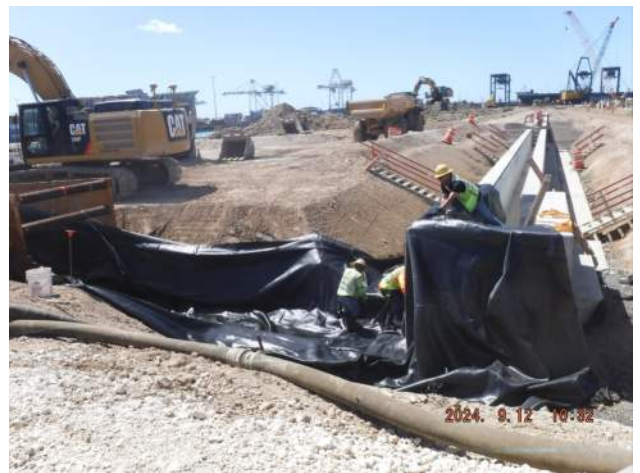
Pier 41: KIWC civil crew (Micah's) installed the geofilter fabric for stabilization layer for the 36-inch RCP installation