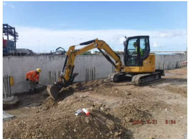
Pier 43: KIWCcivil crew excavated the subgrade between P15 and P16 of the CWCB for the mud mat installation