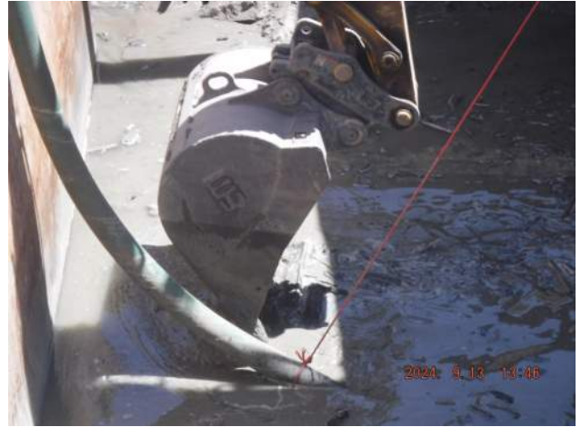
Pier 42: PECL crew used the excavator's bucket to probe the bottom of the excavation per instruction from Geolabs