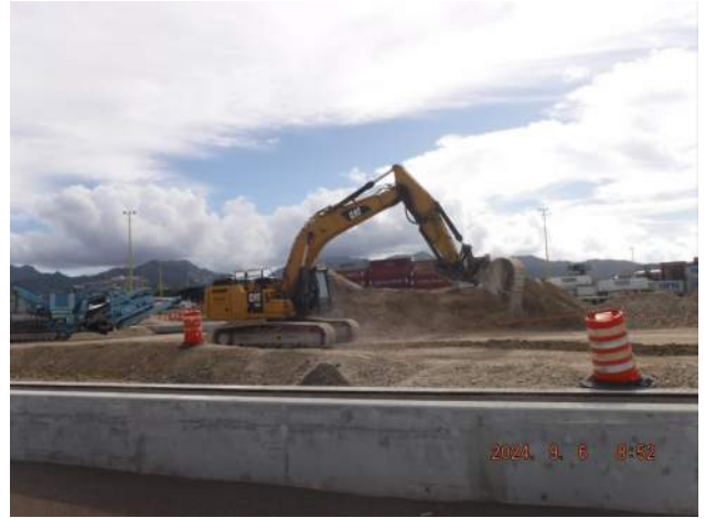
Pier 41: KIWC civil crew constructed earthen berm from STA 26+00 to STA 27+00 east of the trench drain 3