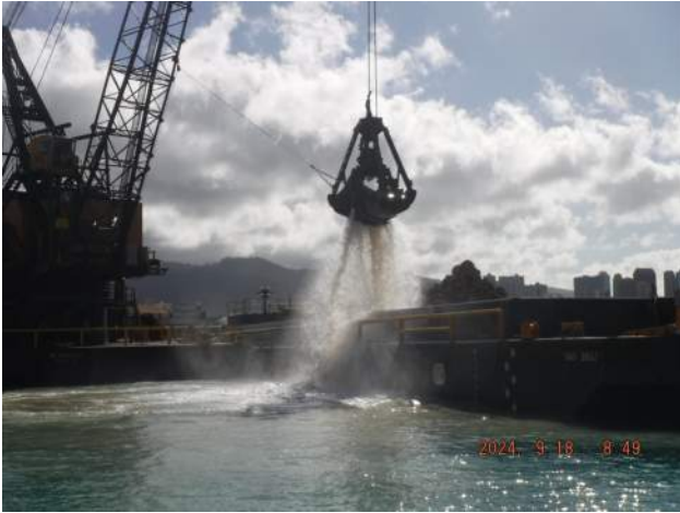
Pier 42: KIWC DB Seattle continued in water dredging from STA 15+00 to STA 14+00