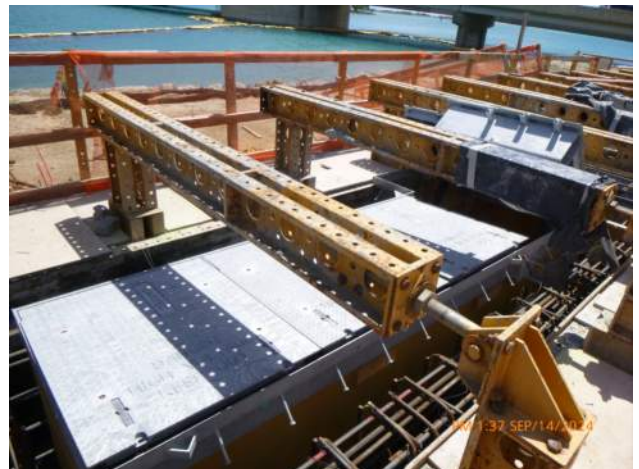
KIWC setting the shore power vault in CWCB pour #23.