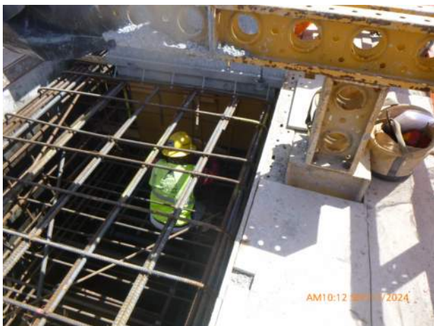
KIWC installing anchors for the oil boom in CWCB pour #23.