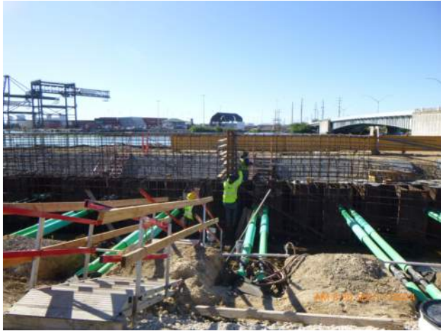
KIWC setting formwork for the bulkhead between capping beam pours #23 and 24.