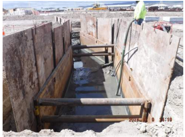
Pier 42: PECL crew able to dewater the trench excavation at 1419 hours. The bottom was measured at 10.0' bgs