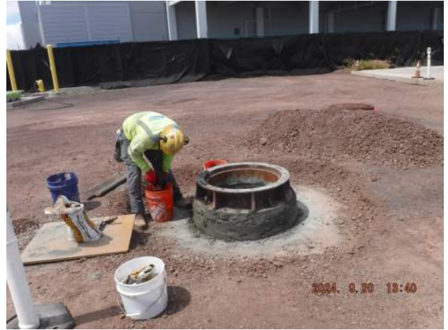
PCCP: Amazon block out - KIWC civil crew grouted the manhole riser of the communication manhole