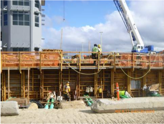
KIWC setting formwork for LSCRB pour #8.