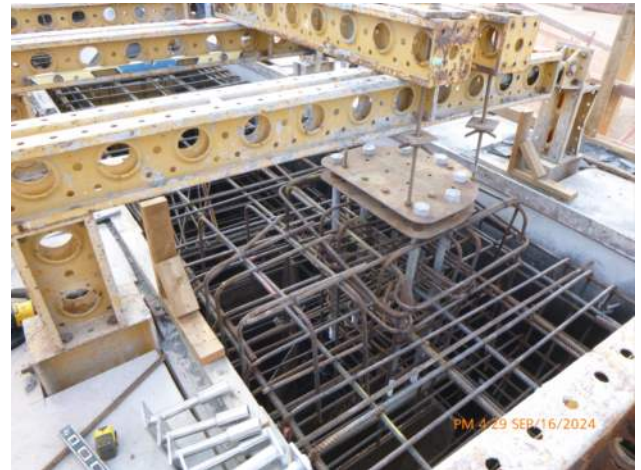
View of the marine bollards in CWCB pour #23.