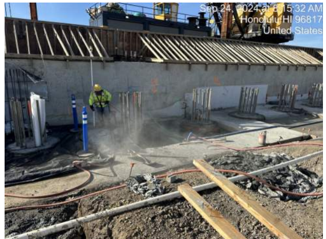
KIWC performing shaft top prep for the CIDH shafts at the crane power vault on Pier 42