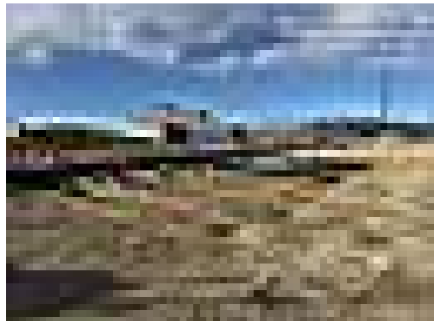
View of the open tie rod trenches for P7 of the LSCRB on Pier 43