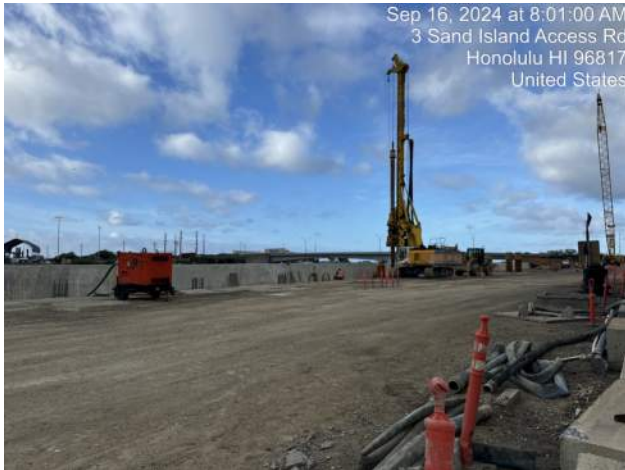
KIWC performed cleanout of the CIDH locations to be poured this shift