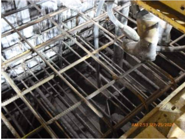
KIWC pouring concrete for CWCB pour #23.