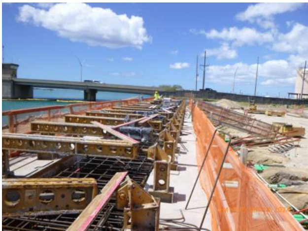
KIWC setting chamfers for the CWCB pour #23 formwork.