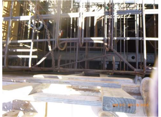
View of the blackout for the safety ladder in CWCB pour #23.