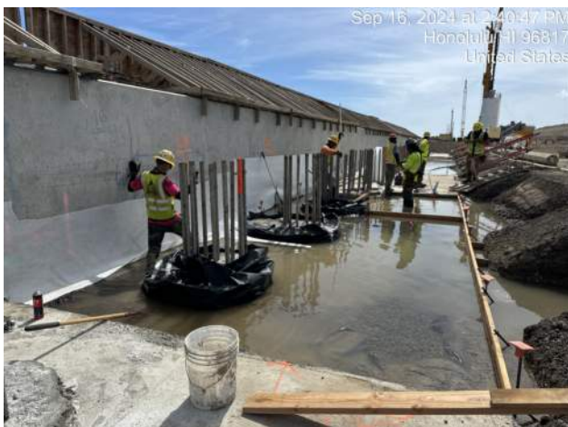
KIWC installed the remaining formwork for the mud mat of the WSCR on Pier 42