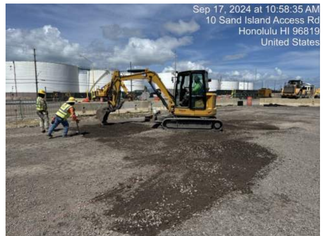
KIWC grading the base course around the water manholes on Pier 43