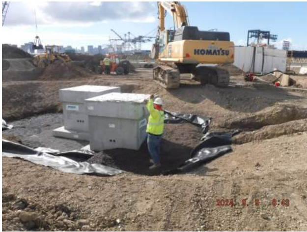
Pier 42: PECL crew placed the #3B fine gravel surrounding the electrical manholes