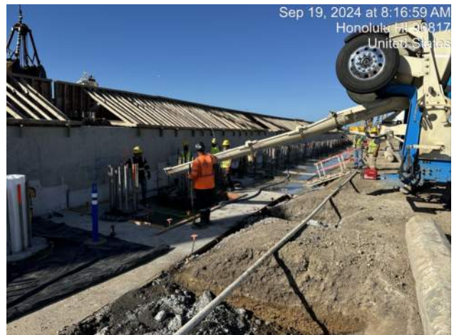
KIWC pouring the mud mat for the cable drum vault for the WSCR on Pier 42