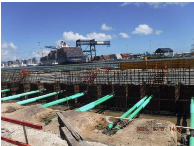
Pier 43: HRSPI and KIWC carpentry crews installed the rebar cage of P23 of CWCB