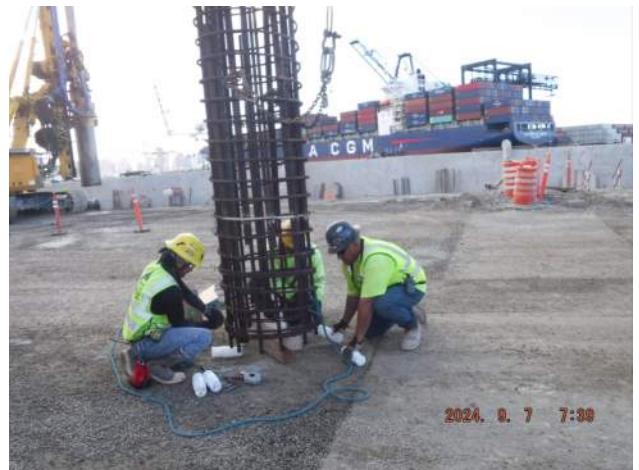
Pier 43: KIWC foundation crew installed six (6) of the 9-inch long PVC shoe for the rebar cage of CIDH #7-A2S-36