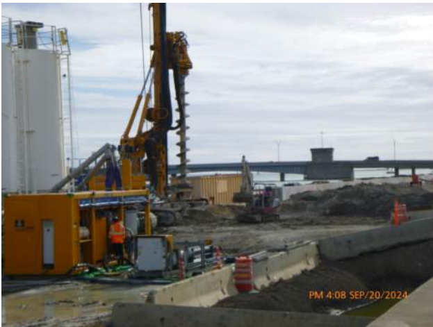
PF soil mixing for the junction structure excavation.