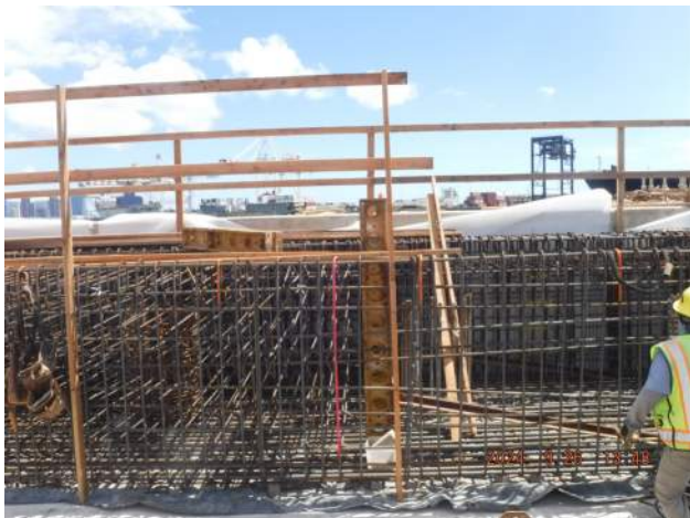
Pier 42: KIWC structure crew continued to install the braces for the headwall and the CJ at STA 17+60