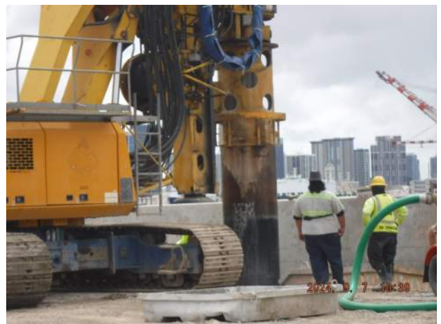
Pier 43: KIWC foundation crew pulled 17-meters of casings from CIDH #7-A2S-36