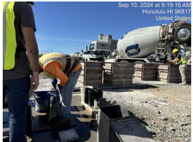
MPE testing truck 1 for the CIDH pour