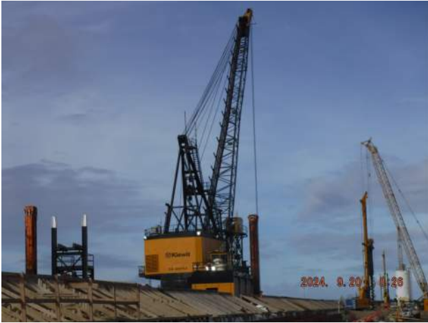
Pier 42: KIWC DB Seattle continued in water dredging from STA 15+00 to 14+00