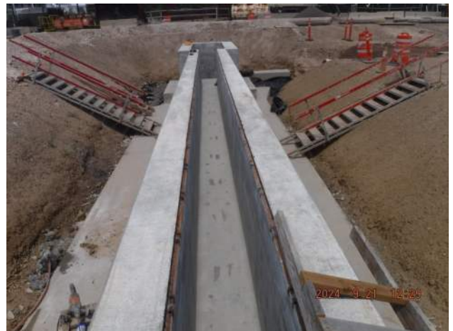
Pier 41: KIWC mason crew continued concrete finishing of the walls of P8 of the TD 3