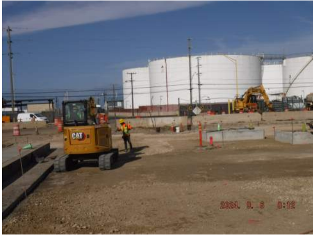
Pier 43: KIWC civil crew fine grading the subgrade surrounding the water manholes (WL - 1 and 2)