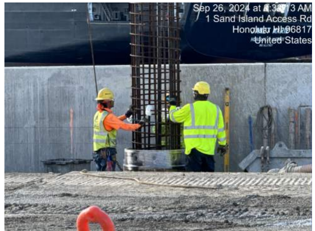
KIWC setting the rebar cage for the CIDH installations on Pier 43