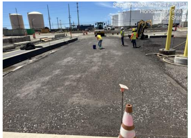
MPE performing compaction testing for the "south lane" of the water manhole blackout on Pier 43