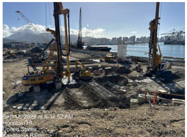
PF continued soil mixing at the junction structure area