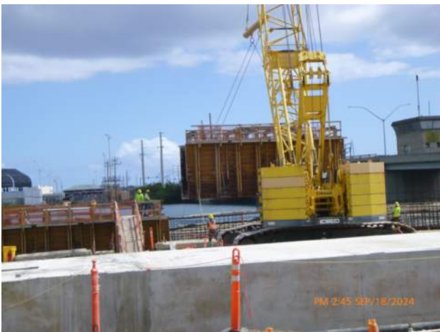
KIWC installing formwork for CWCB pour #24.