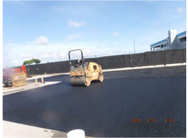
PCCP: Amazon block out - RB crew used the Mikasa vibratory steel plate on the edges of PCCP to prevent spalling of the existing PCC