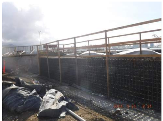
Pier 42: KIWC carpentry crew trimmed the polyvinyl sheet bond breaker of the WSCRB from STA 18+55 to STA 16+35