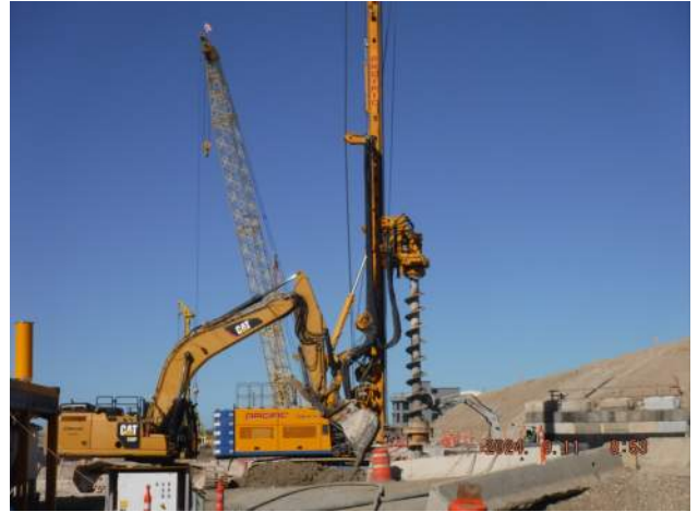
Pier 42: Junction Structure - PF continued to pre-drill the area south of the 48-inch CIDH piers