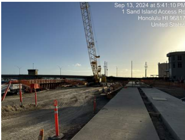
KIWC departing from the site