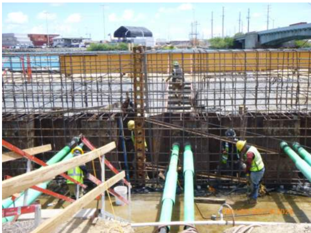
KIWC installing formwork for the bulkhead between capping beam pours #23 and 24.