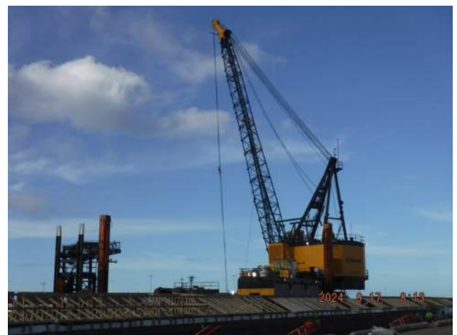
Pier 42: KIWC DB Seattle continued in water dredging from STA 15+00 to STA 14+00