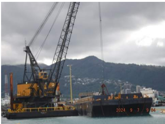
Pier 42: KIWC Bridge and Marine crew used the DB Seattle to dredge between STA 16+00 to STA 18+00