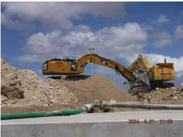
Pier 43: Dredged stockpile - Civil crew used the CAT 336 excavator to screen the dredge material