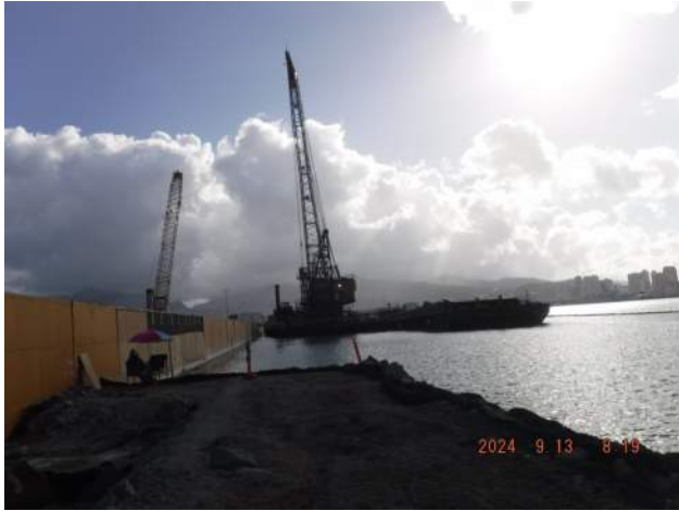
Pier 42: KIWC DB Seattle continued in-water dredging from STA 15+50 to STA 14+50