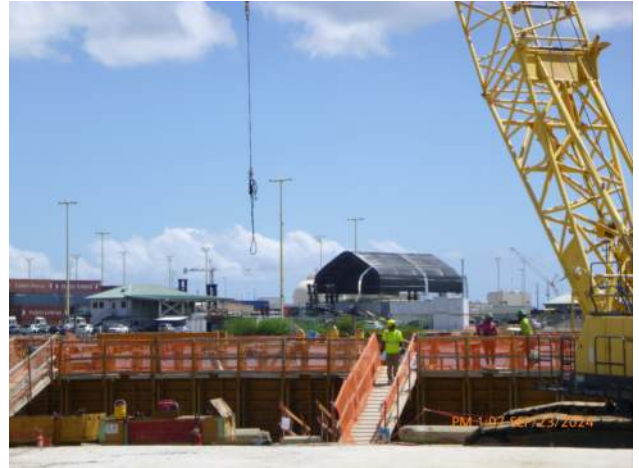
KIWC installing formwork for capping beam pour #24.