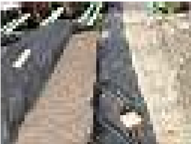
KIWC backfilling the tie rod trench extensions with 3b.