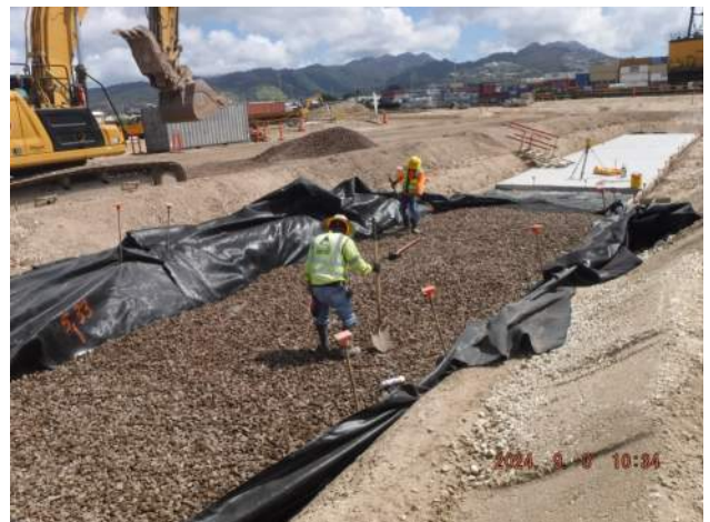
Pier 42: KIWC civil crew placed #2-course gravel in "burrito" wrap for the TD 2 mud mat pour between STA 6+35 and STA 6+93