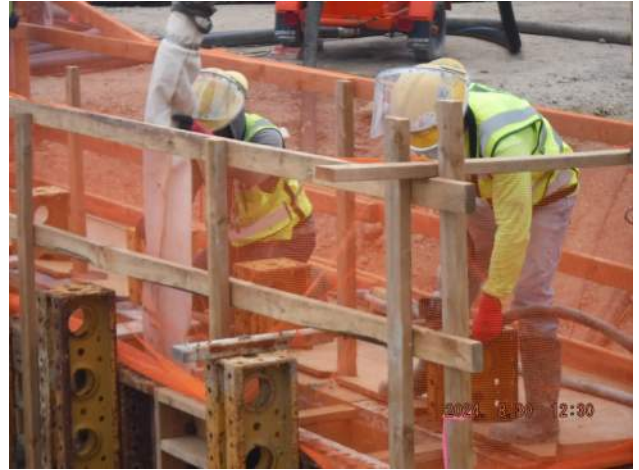
Pier 40F: The crew used concrete vibrators to consolidate the concrete pour