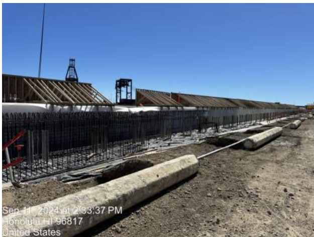
Progress setting the WSCR reinforcement on Pier 42