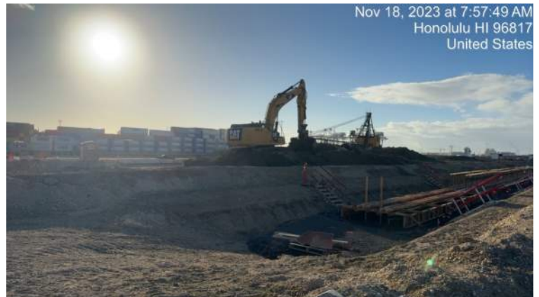
KIWC prepping to move dredge spoils from P41 to Snug Harbor