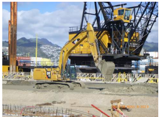
KIWC dredging along the pier 41 capping beam.