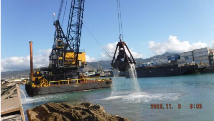
Pier 41: KIWC Bridge and Marine crew continued in water dredging