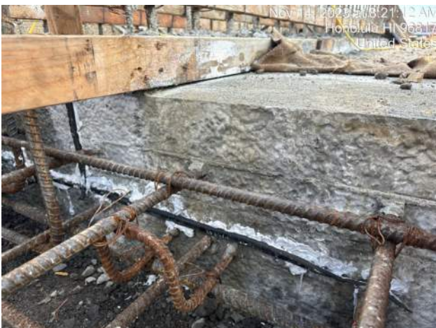
View of the waterstop installation for the TD-3 P6B pour