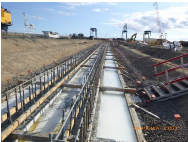
View of TD-3 pour #3 post pour.