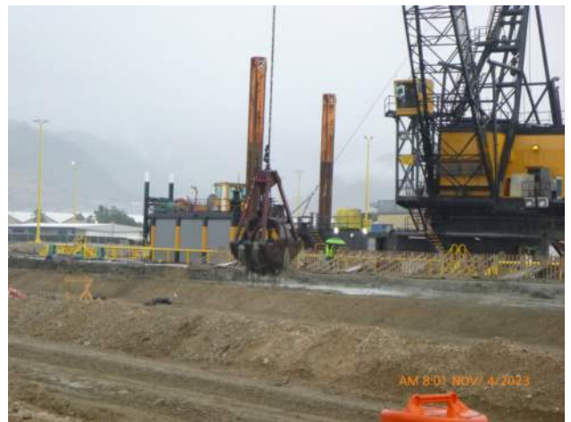
KIWC dredging along the pier 41 capping beam.