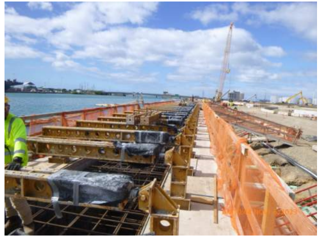
KIWC performing corrections to capping beam pour #7 rebar cage.