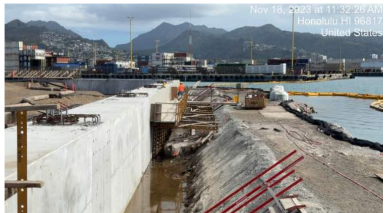
KIWC continued dry finishing the waterside of the capping beam on Pier 42