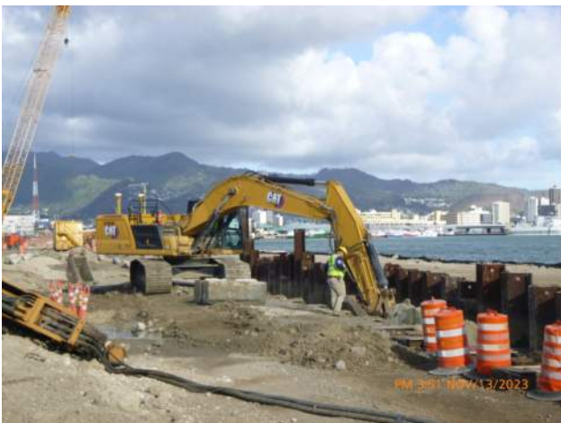
KIWC excavating on the landside of the snug harbor cutoff wall.