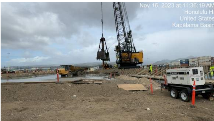
KIWC placing dredge spoils into the CAT 730 dump truck on Pier 41