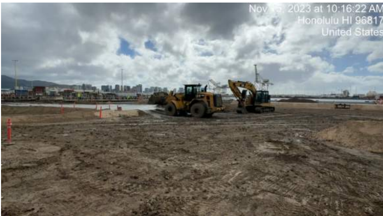
KIWC civil crew assisting the dredging operation on Pier 41