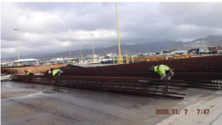
PCCP: HRSPI crew continued to install the CSL tubes into the 36-inch CIDH rebar cage