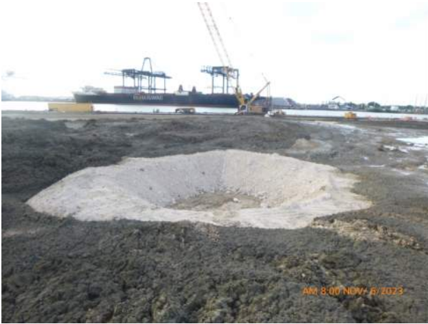
View of full depth vibration monitor locations in snug harbor fill.