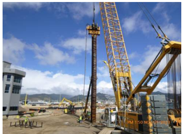
KIWC driving double king piles on pier 43.