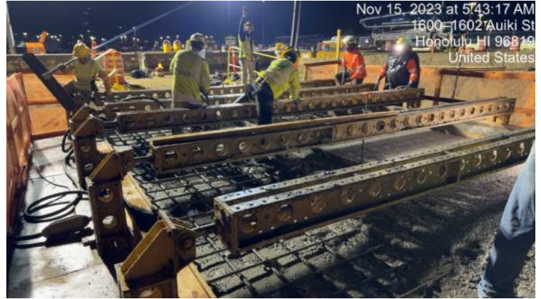
KIWC finishing the deadman P0 pour on Pier 41