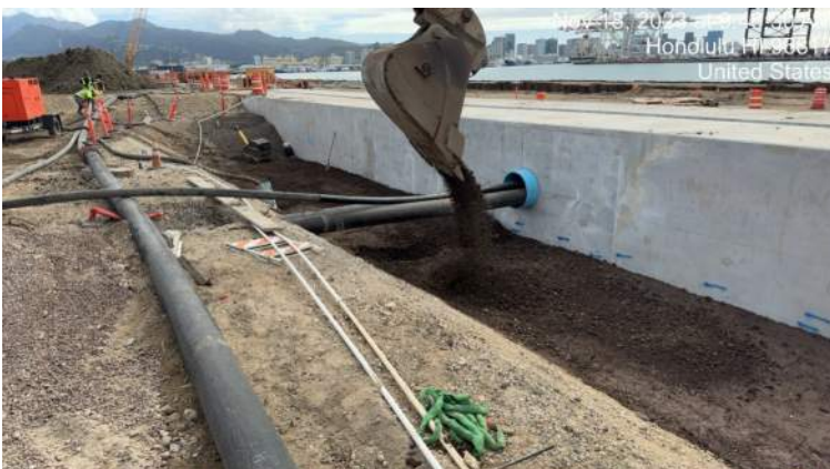
KIWC backfilling P2 and P3 of the landside of the LSCRB on Pier 43