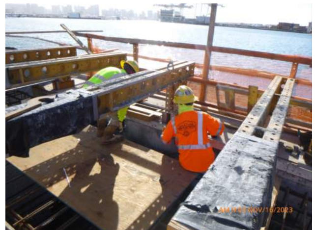
KIWC installing formwork around capping beam pour #9.