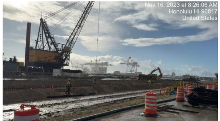
KIWC continued dredging on Pier 41