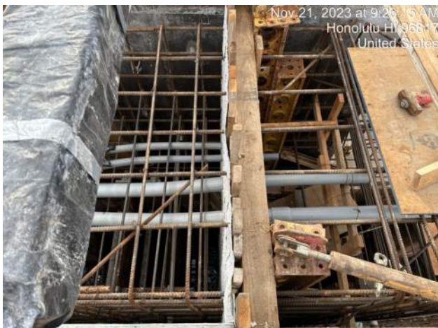
View of P9 of the capping beam on Pier 42