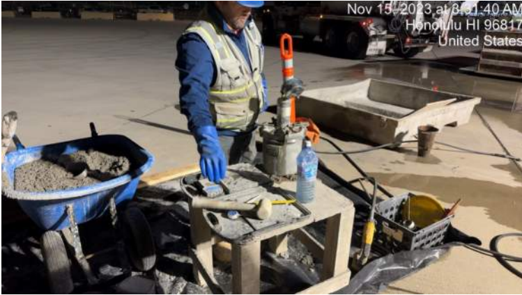
MPE on site performing concrete testing for the deadman P0 concrete pour