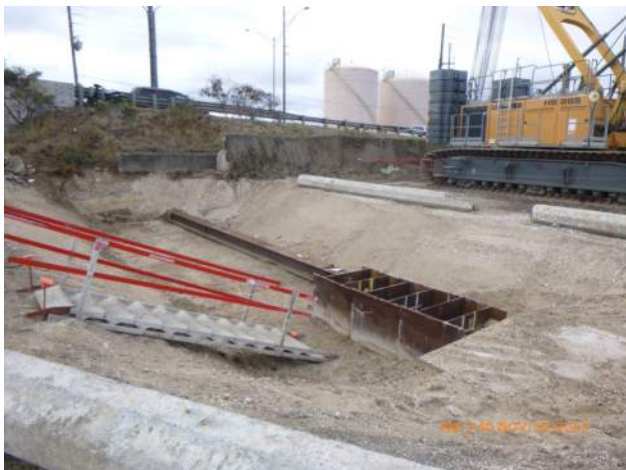
View of template for continuous double king pile wall on pier 43.