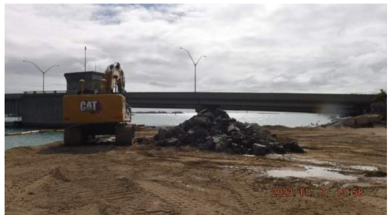
Pier 43: KIWC civil crew constructed riprap at the water edge