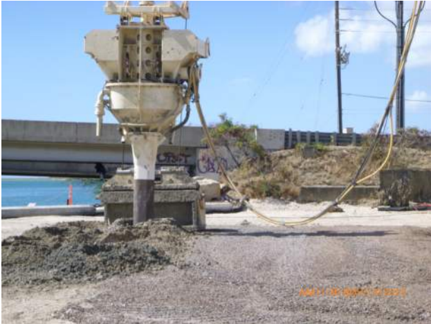
KIWC installing stone columns on pier 43.