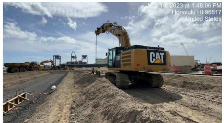
KIWC and HRSPI prepping to install a rebar cage for P2 of TD-3 on Pier 41