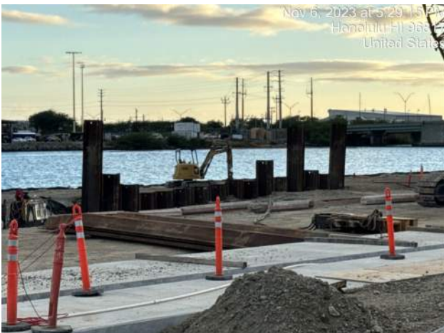
KIWC finished installing sheet piles for the shift on Pier 43