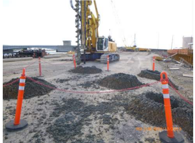
View of predrilled holes in test area 1.