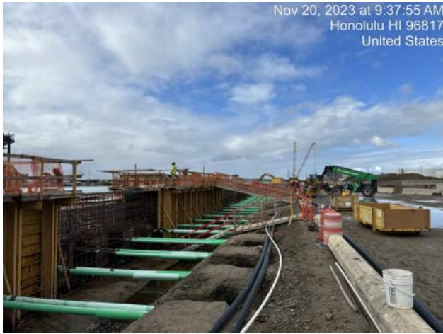
KIWC continued installation of formwork and embeds at P5 of the capping beam on Pier 42