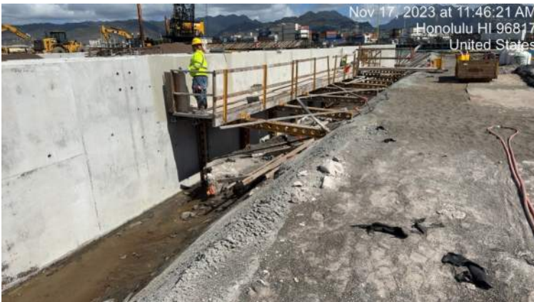
KIWC masons dry finishing the waterside of the capping beam P2 and P3 on Pier 42