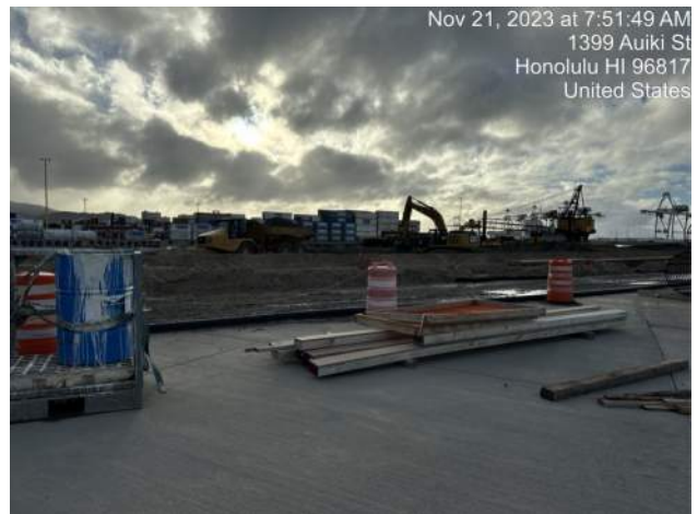
KIWC moving dredge spoils from Pier 41 to Pier 42