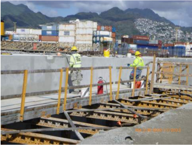
KIWC finishing the surface of the P42 capping beam.