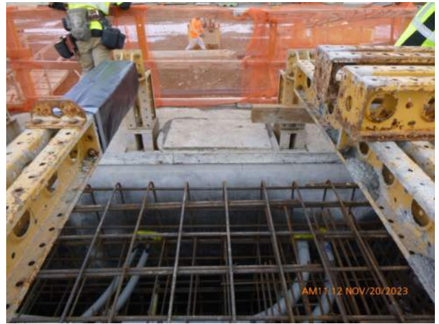
View of conduit from shore power vault in capping beam pour #9.