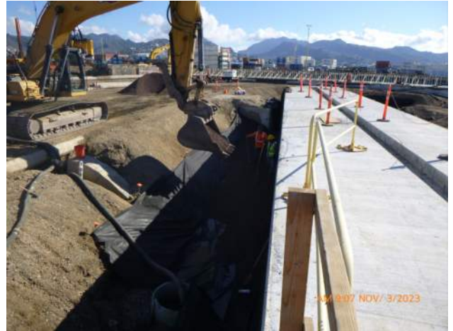
KIWC backfilling along the landside of LSCRB pour #1.