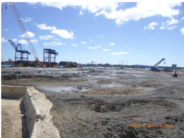
View of dredged spoils on snug harbor fill.